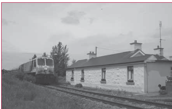
Islandeedy Railway Station - 1914 to 1963

"We have a lovely priest who is interested in the community."