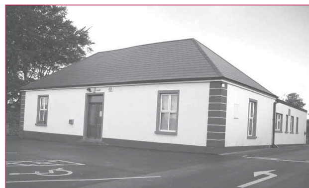
Islandeady Community Centre