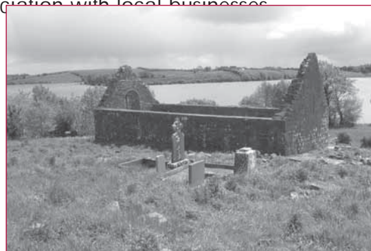
13th Century Islandeady Church Cemetery

Business and Tourism Action Group in association with local businesses