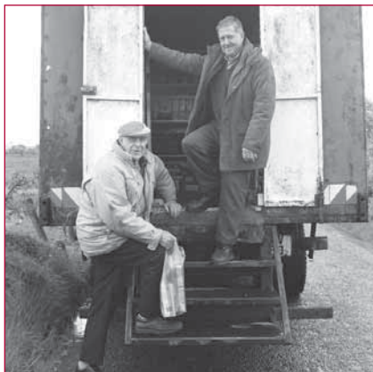
The Travelling Shop