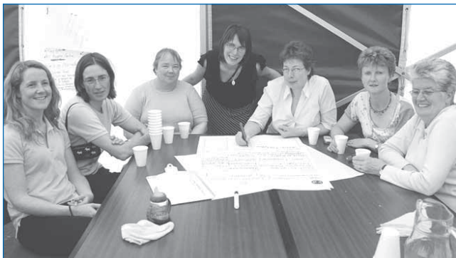
Community Open Day 10th June 2006